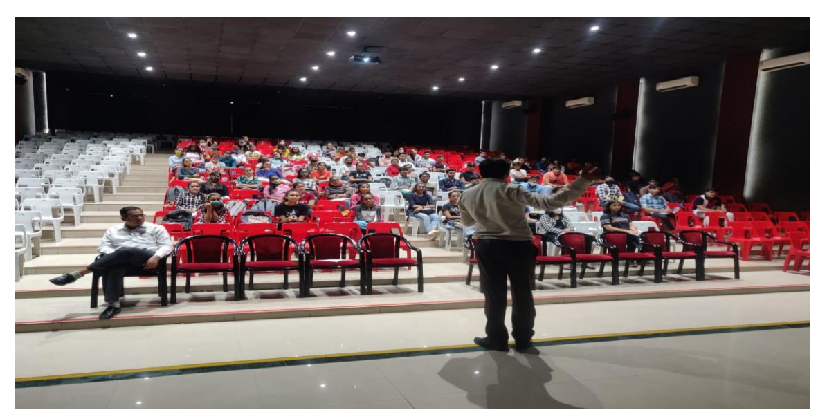
Movie Based Learning