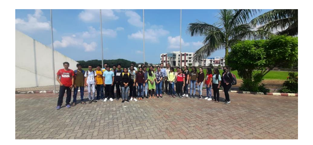
Institute and Campus visit

In the post lunch session students were taken for Institute and Campus visit with their respective class counsellor. Students has visited Library, sports facilities, Gym and Yoga center etc in the campus.