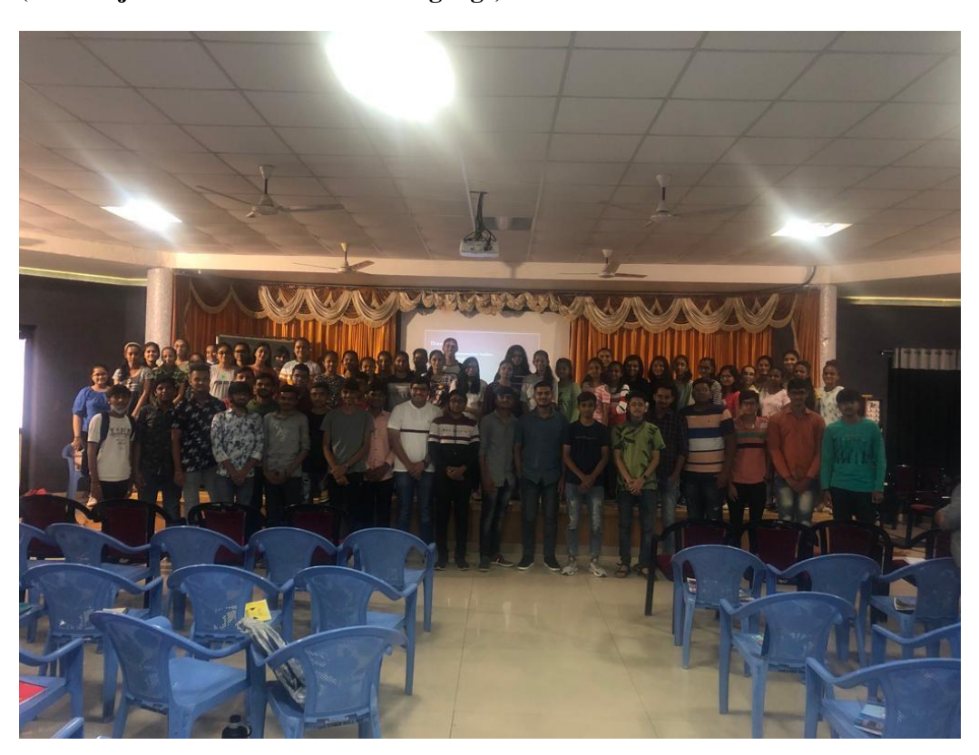
(Group Picture of First Year B. Pharma and First Year Pharm. D.)